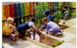
Community Partnership projects this year have included a garden built for Ethelred Nursery School. This provides a safe, sheltered environment with small planting beds that are easy to use by the children. Funded by Cross River Partnership.