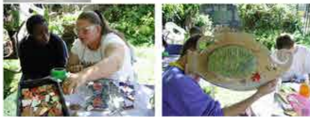
Above and right: Two of the clay tablets forming the signs, trainees work on the mosaics and the Wildlife Garden sign and on installing the post; trainees and a volunteer grouting the post.