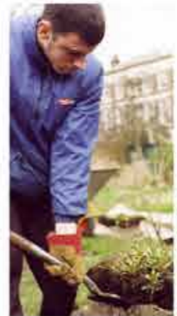
Life skills training also involves staying happy (as well as all that work in the classroom)!