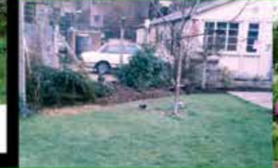
The same view now across the summer meadow.