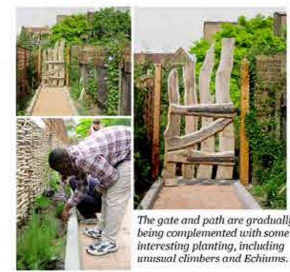
The gate and path are gradually being complemented with some interesting planting, including unusual climbers and Echiniums. Students from Tippett School help with planting along the new path.