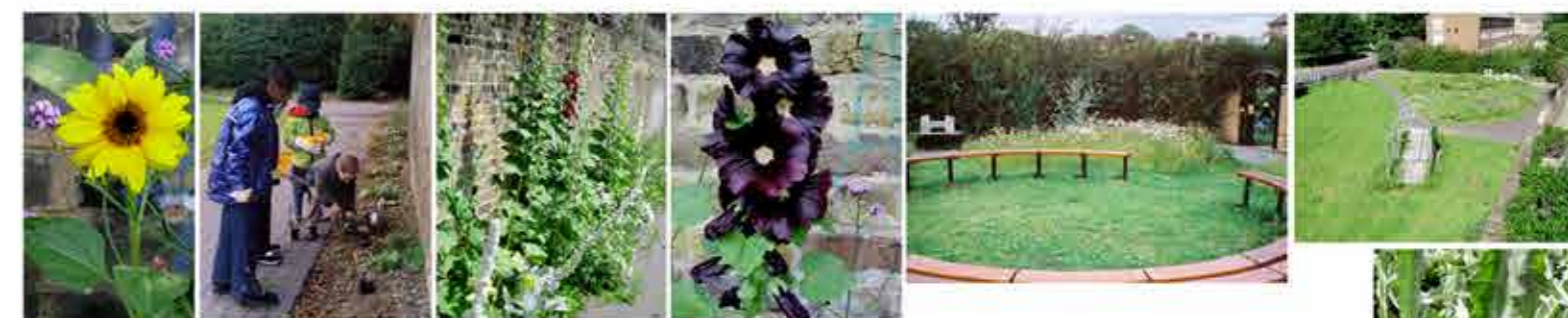
The development of Lambeth Walk Open Space (funded by the Cross River Partnership) continued with a community planting day in December 2001, when the border along the wall was expertly planted (left) - as shown by the fine plants in the summer. The rose arch was also planted along with many bulbs. The Friends' arched seat and the large circular bench were installed by trainees and staff in spring. This was all opened on our Grand Open Weekend as part of the National Gardens Scheme. Cllr. Peter Truesdale planted a strawberry tree (below), and Kate Hoey MP formally opened the new gardens watched by many faithful Friends.