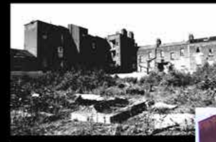
Derelict. In 1982 the garages that were on the site from early in the 20th century are demolished. The arch punched through no.10 Walnut Tree Walk for access is still there. These houses are empty and near-derelict. The floors and demolition debris from the garages are colonised by buddleia with a lot of fly tipping. Roots and Shoots will soon start to build what will become the Wildlife Garden.