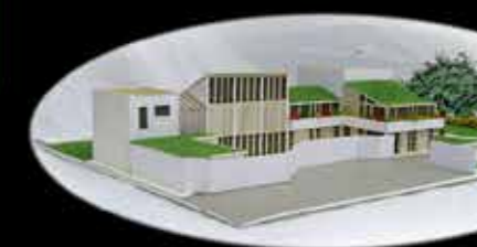
The architect's model gives a good idea of how the new building will look. Posed in front of the existing, war-time building (below) the contrast is clear.