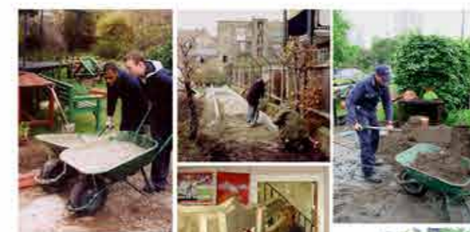
The new path to the Wildlife Garden with a new tool shed alongside, was the second of the site improvement projects this year (funded by Lambeth Riverside SRB5). It was an opportunity for trainees to join in with some heavy team work - shifting cement, sand, earth and laying paving. The path is crowned with a fine oak gate complete with old, reclaimed hinges originally made in Lambeth. The oak was left from the children's shelter project two years ago and the design makes full use of the natural forms of the original sawn planks.