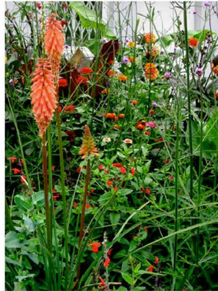
Three views of the 'Lambeth Hot-beds' outside the office of Roots and Shoots, July 2002 Planting sponsored by the Metropolitan Gardens Association