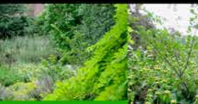
It is 20 years since Linda and the first trainees began work at Roots and Shoots. These images show the effects of this time on the garden and training centre.