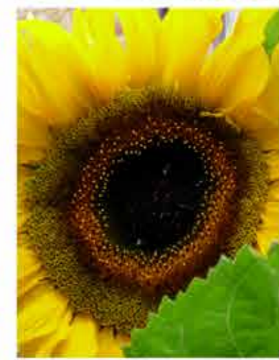
The trainees also entered the Thrive annual show in Battersea Park. They were very proud of their exhibits (including a scarecrow and cut flower arrangement seen here), winning several prizes.